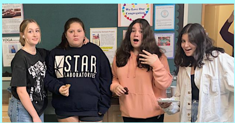
Teens in our Y.O.U. program!